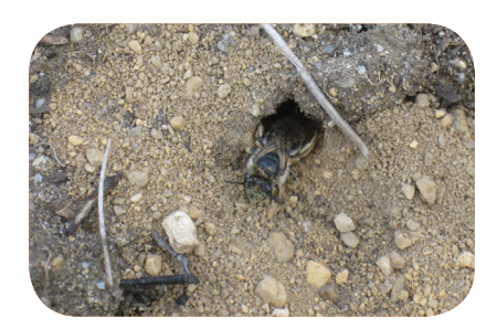
Mining bees nest underground. Their holes resemble ant hills. They may nest in loose or compact soil, but sandy soil is preferred.

Bundles of hollow plant stems or bamboo can be placed out for bees to nest in. The capped ends of nesting tubes tell you what species are developing inside.