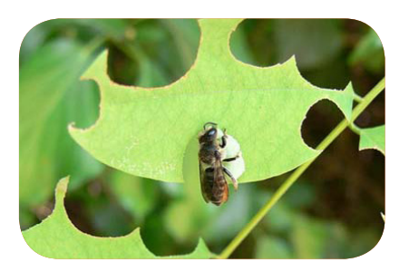
If you see leaves like these, you have beneficial leafcutter bees at work. They use these leaf pieces to line their nests.